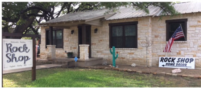
Pedernales Peddler Rock Shop 505 E. Main Street, Johnson City, TX