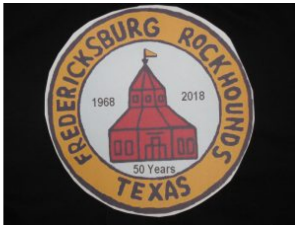
Table of Contents (#toc)